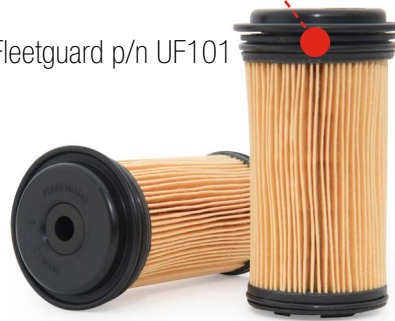
Fleetguard p/n UF101